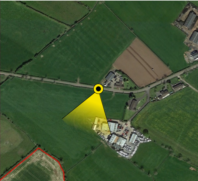
Aerial Location Map