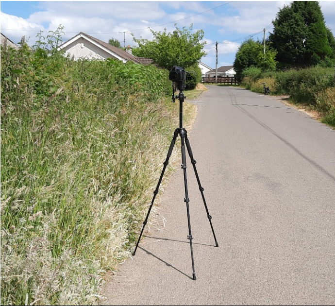
Tripod location image