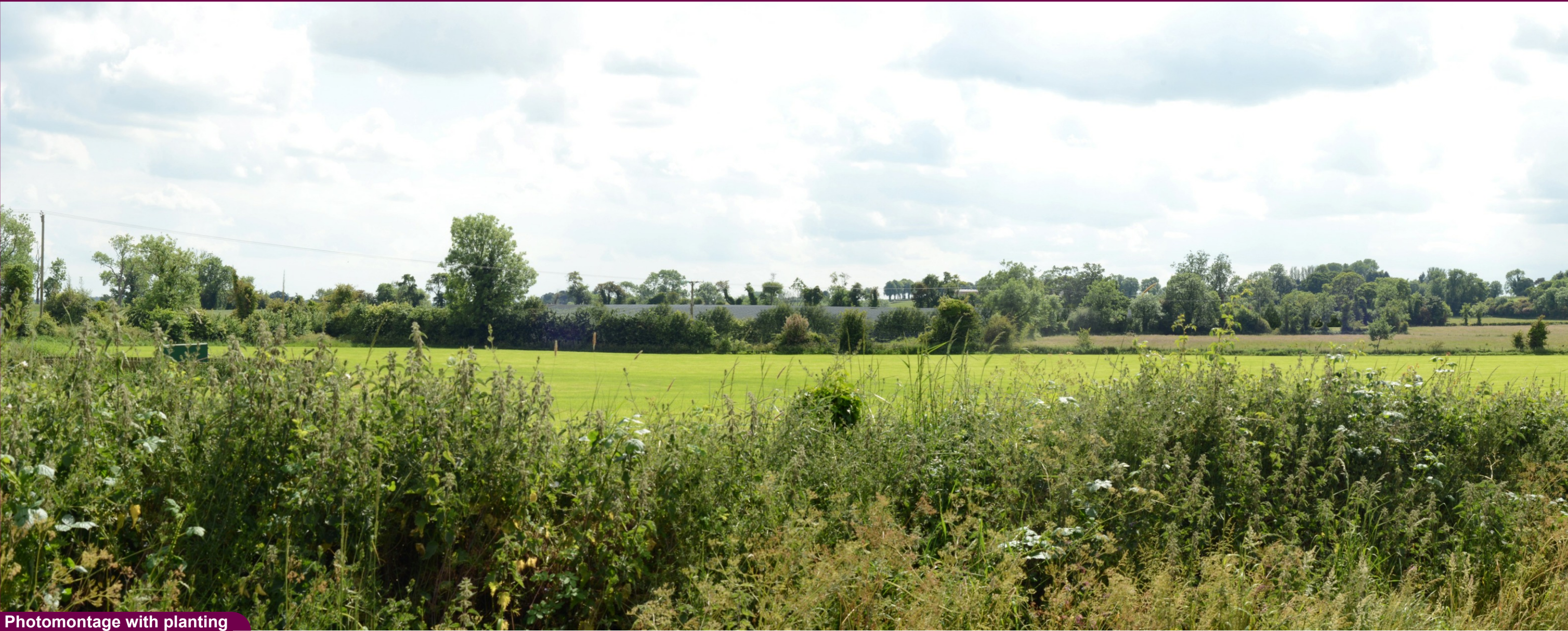
Photomontage with planting