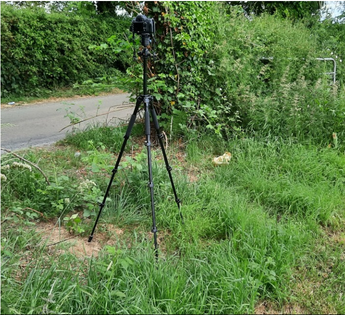
Tripod location image