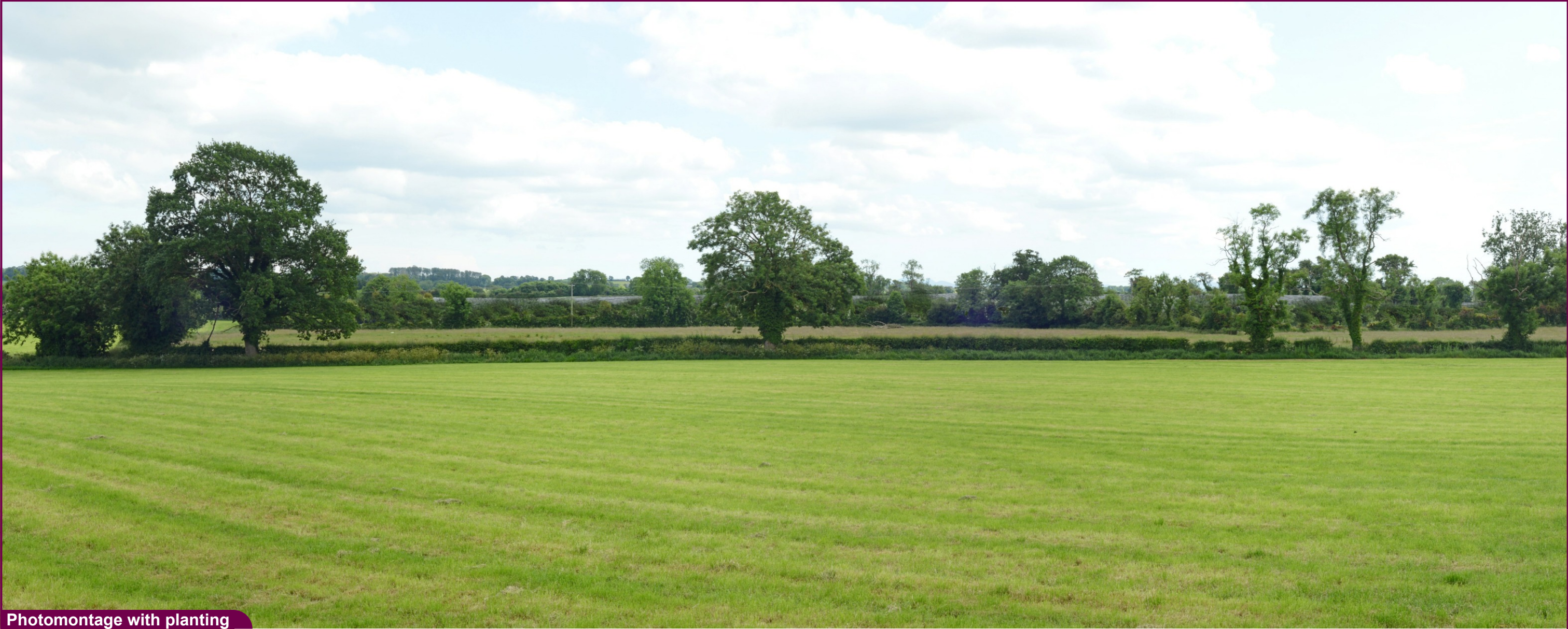
Photomontage with planting