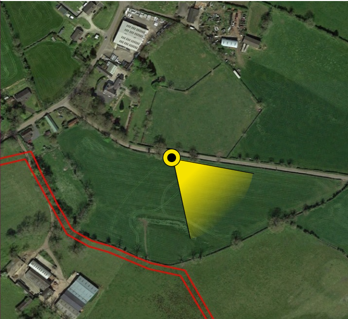
Aerial Location Map