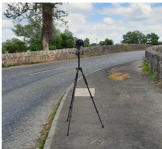
Tripod location image