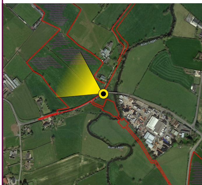
Aerial Location Map