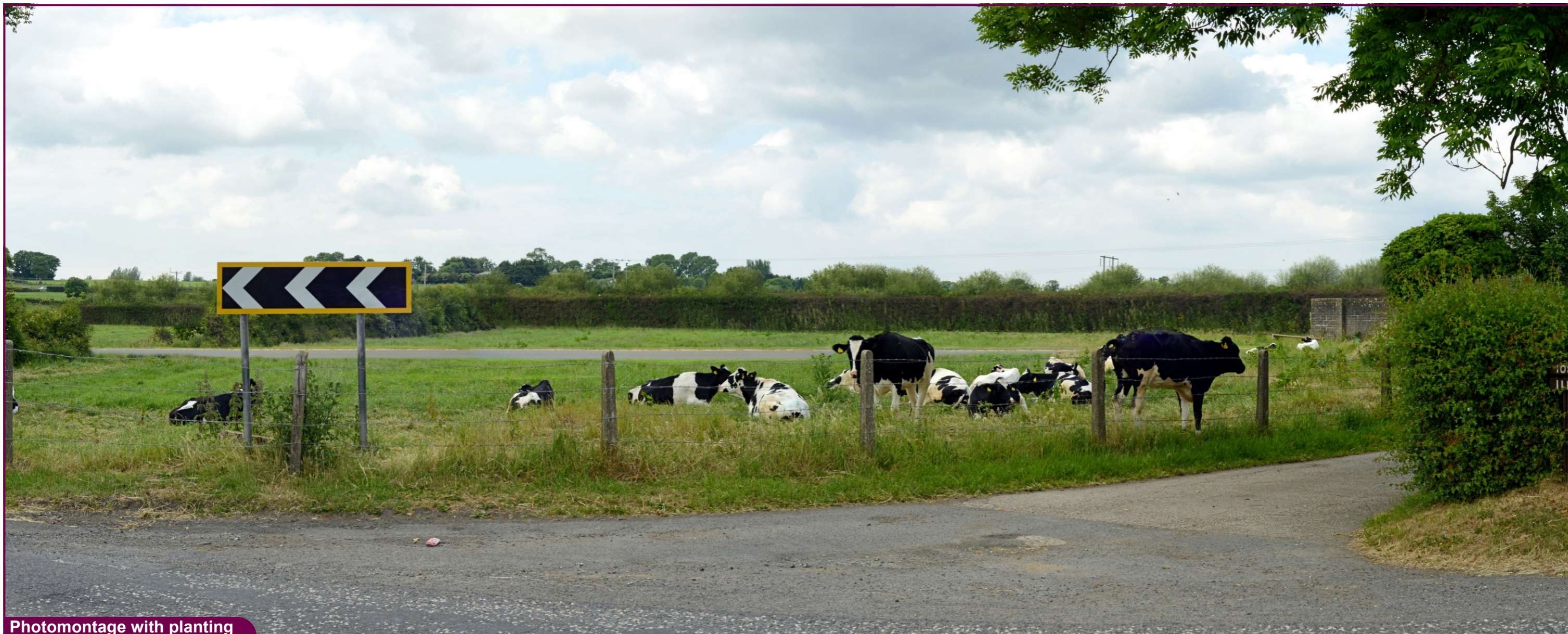
Photomontage with planting