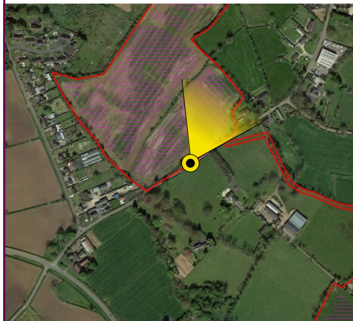
Aerial Location Map