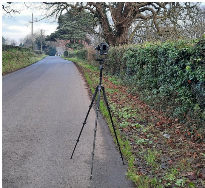
Tripod location image