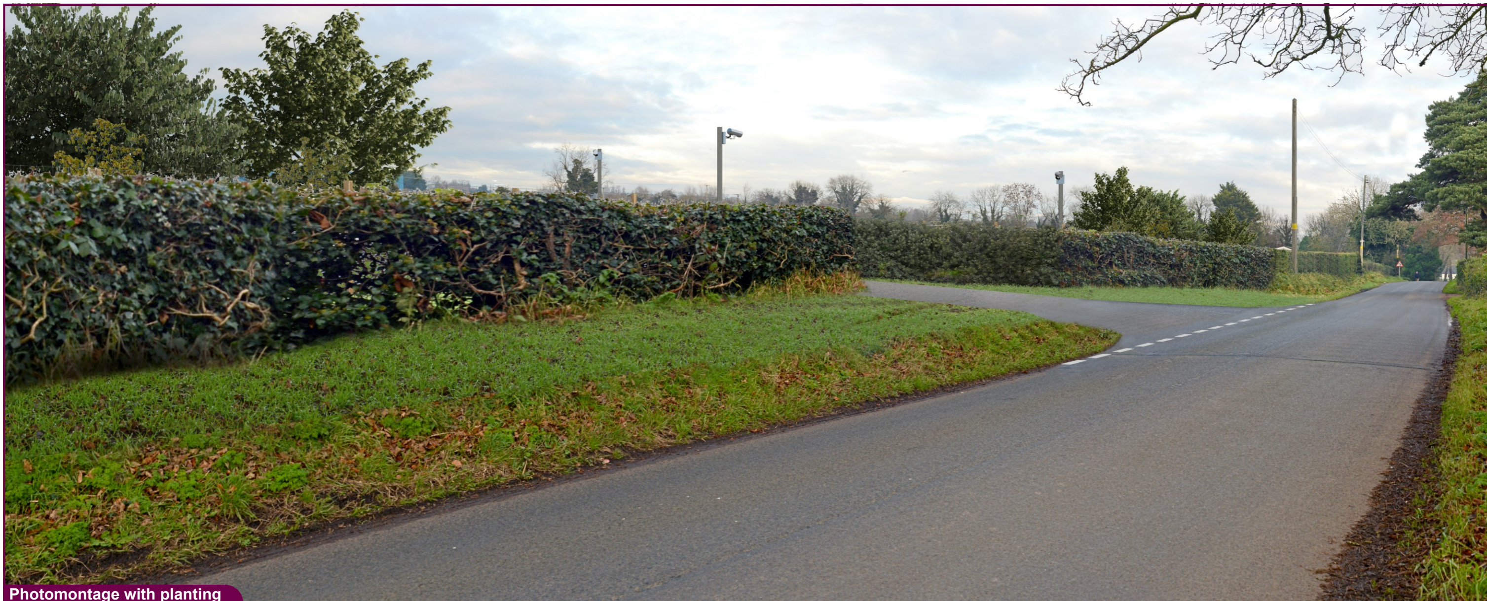
Photomontage with planting