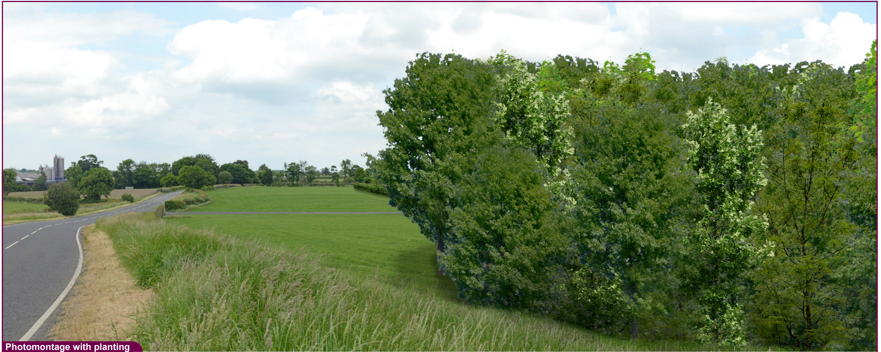
Photomontage with planting