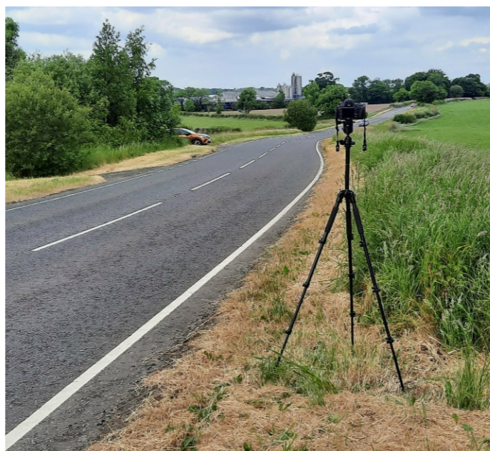
Tripod location image