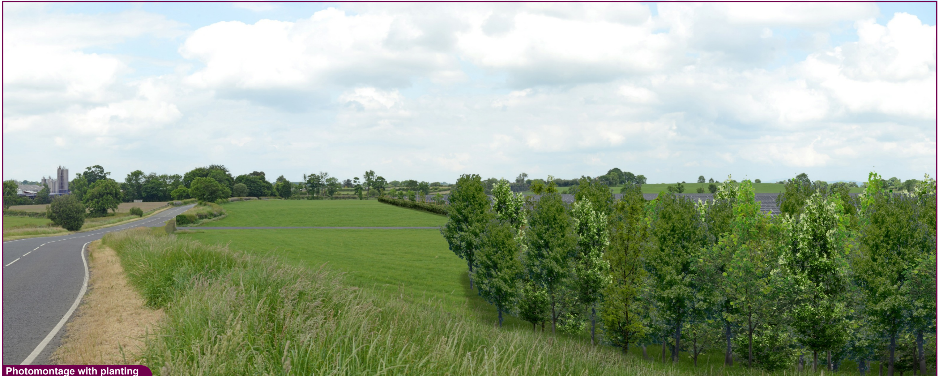
Photomontage with planting