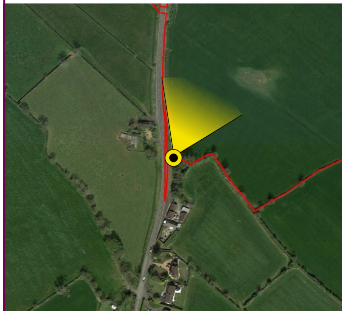
Aerial Location Map